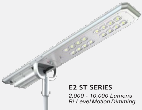
E2 ST SERIES 2,000 - 10,000 Lumens Bi-Level Motion Dimming

STANDARD KELVIN TEMPS ARE 3000K-6000K, LESS THAN 2% BLUELIGHT AVAILABLE.