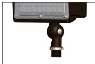
1/2" NPS Knuckle Mount (For 27W, 45W and 60W only)