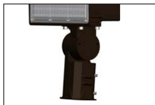
Slipfitter Mount (For 70W and 100W only)