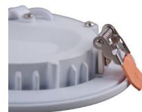
RAISED BACKSIDE H - 1/2" W - 6 1/8"